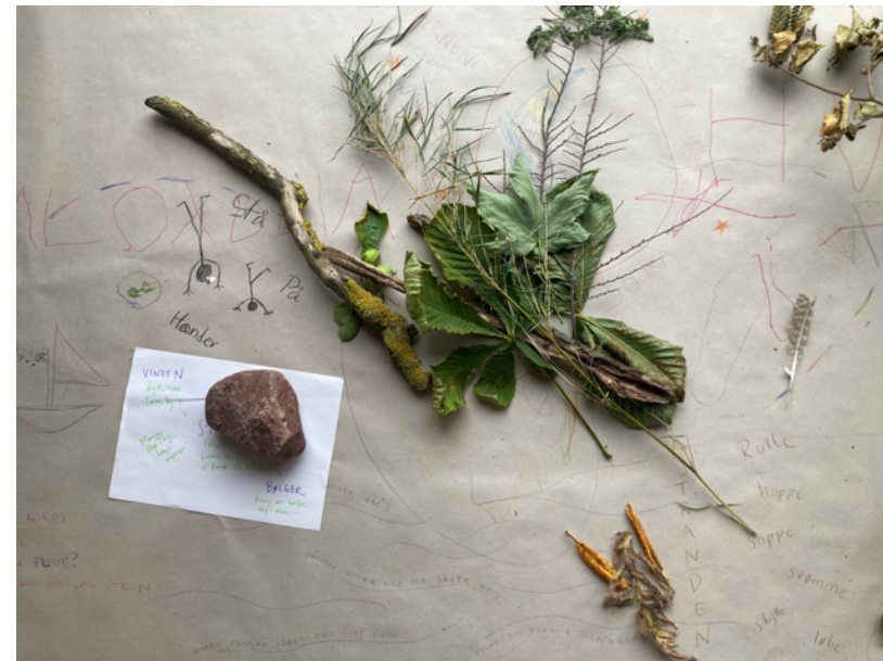
Pictures from the final “roll of documentation” which was continuously filled out by all participants throughout the residency.