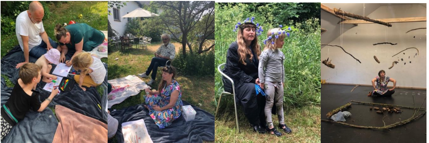
Atmosphere from the first BIRCA Kids

"It was thought-provoking and a celebration of family life and acting"