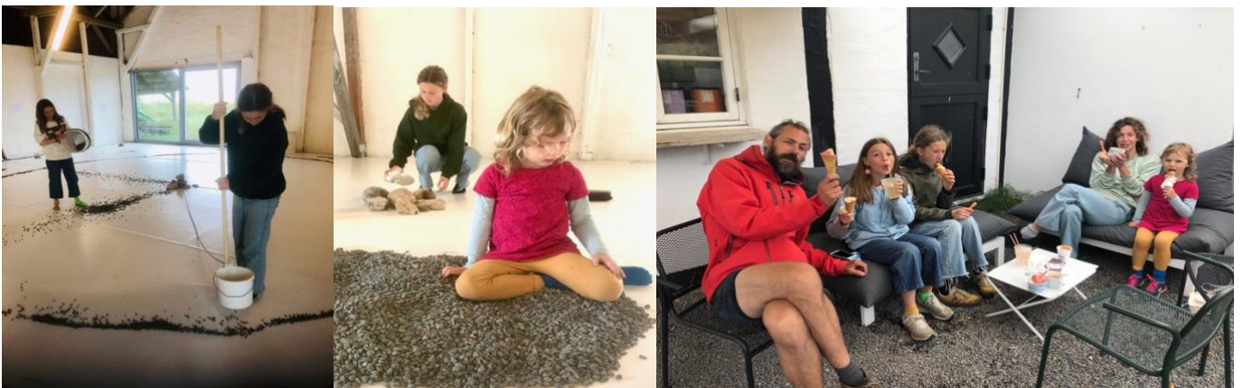
Atmosphere from the second BIRCA Kids