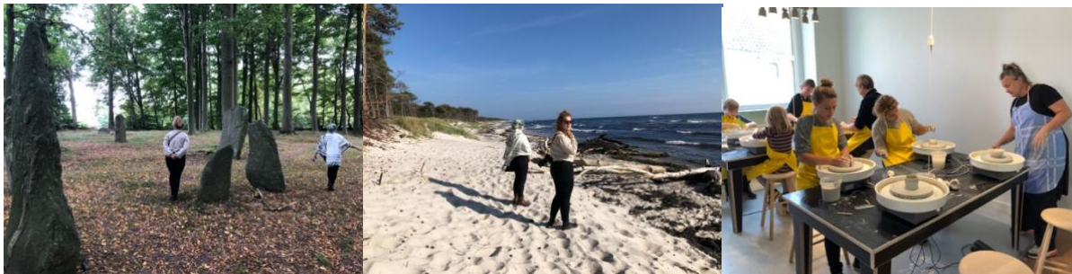
Visiting Louisenlund, Kødtønden and the ceramic workshop Hej Keramik