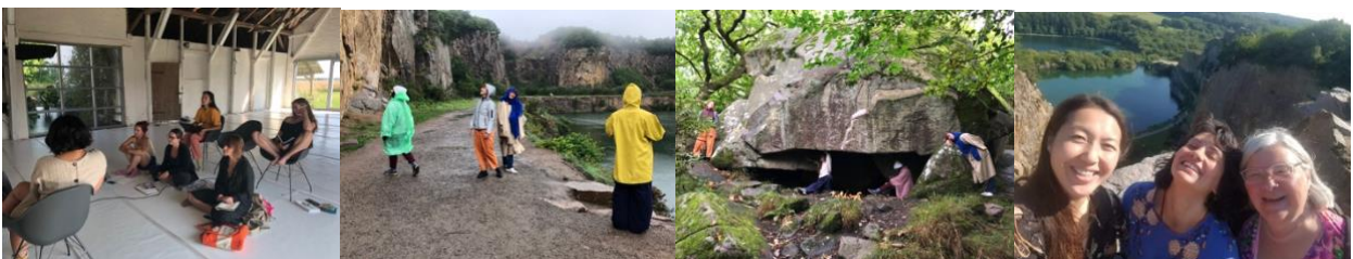
Atmosphere from our research